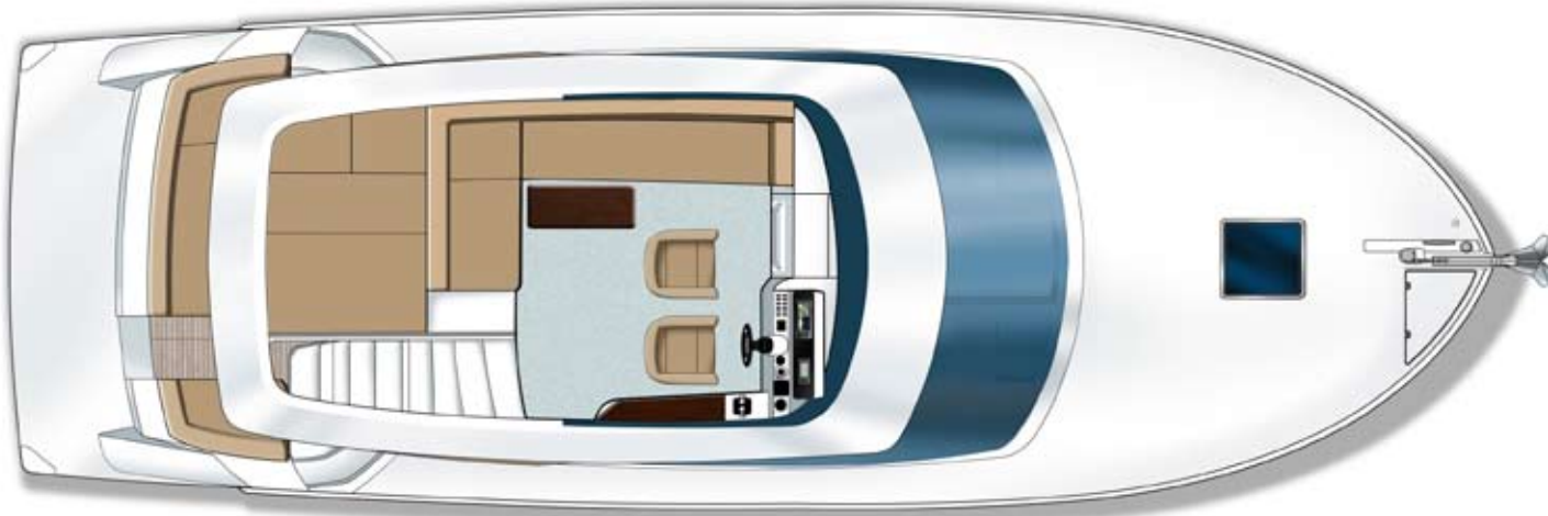
Salon with Optional Lower Helm