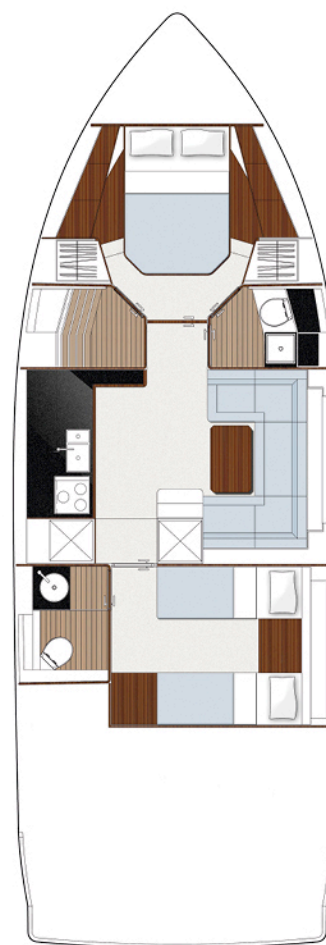
Lower Deck with IPS engines