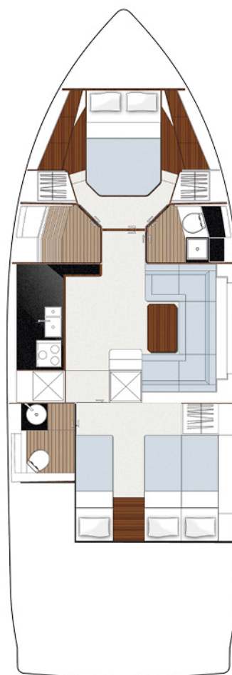
Lower Deck with Sterndrive